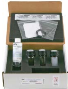
Calibration Kit, 1000, 10 & 0.02 NTU/FNU

The Calibration Standard kits contain fluids in special cuvette bottles that are used to compare the clarity of the process water against the standard to calibrate the turbidity instrument. The standard kits come in two pre-mixed, calibrated ranges.