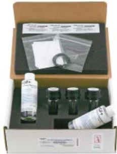
Calibration Kit, 100, 10 & 0.02 NTU/FNU